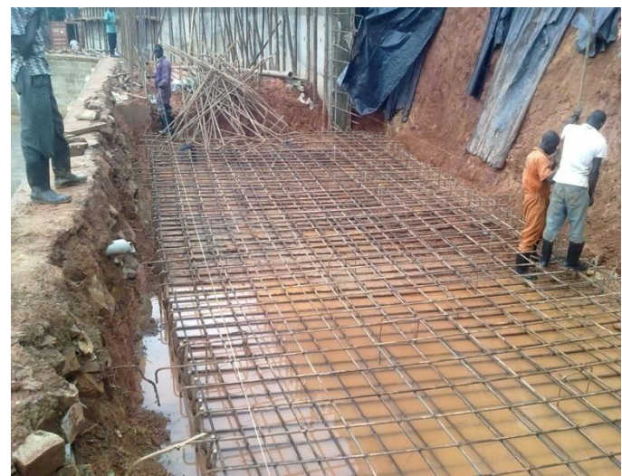
Casting of RCC Retaining Wall and Foundation Steel Works