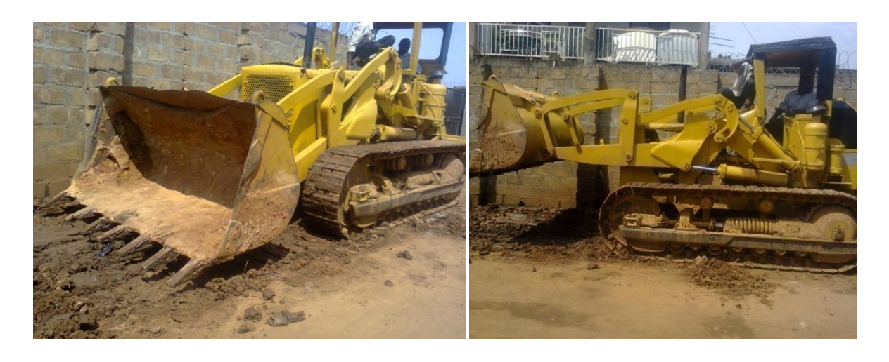
Track Loader machine on site