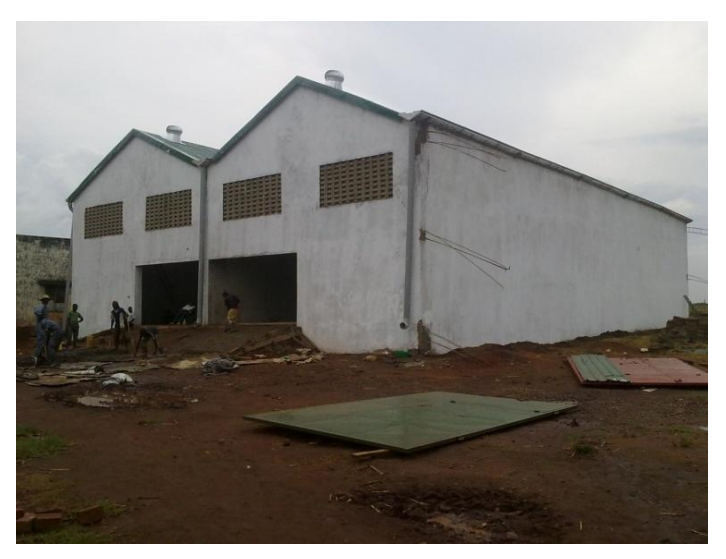
Warehouse Under construction-Silver Oak Investments