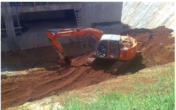
Excavation of Foundations and Backfilling Stage-Kingdom Kampala Ltd