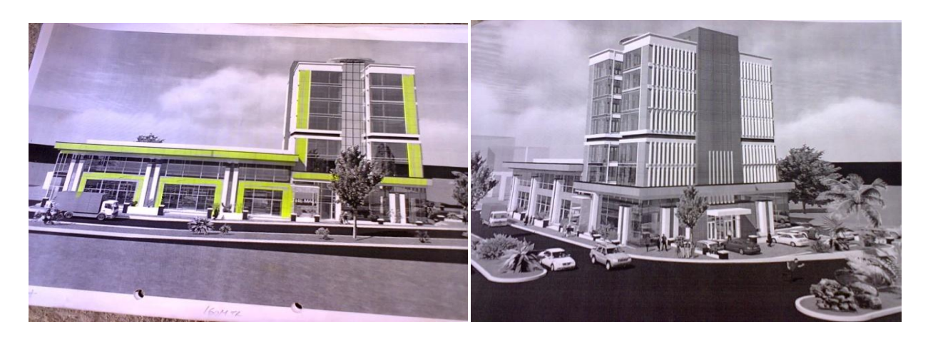
Offices at Jinja Rd-Meera Investments Td