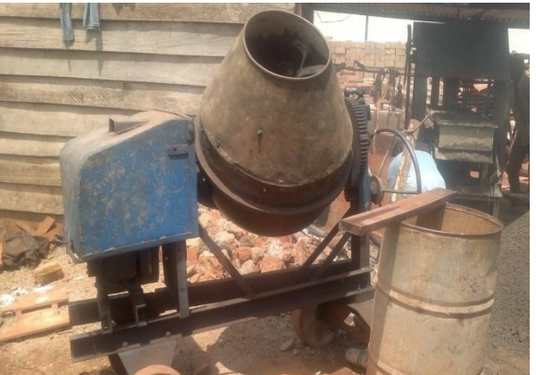
Excavator machine and concrete mixer