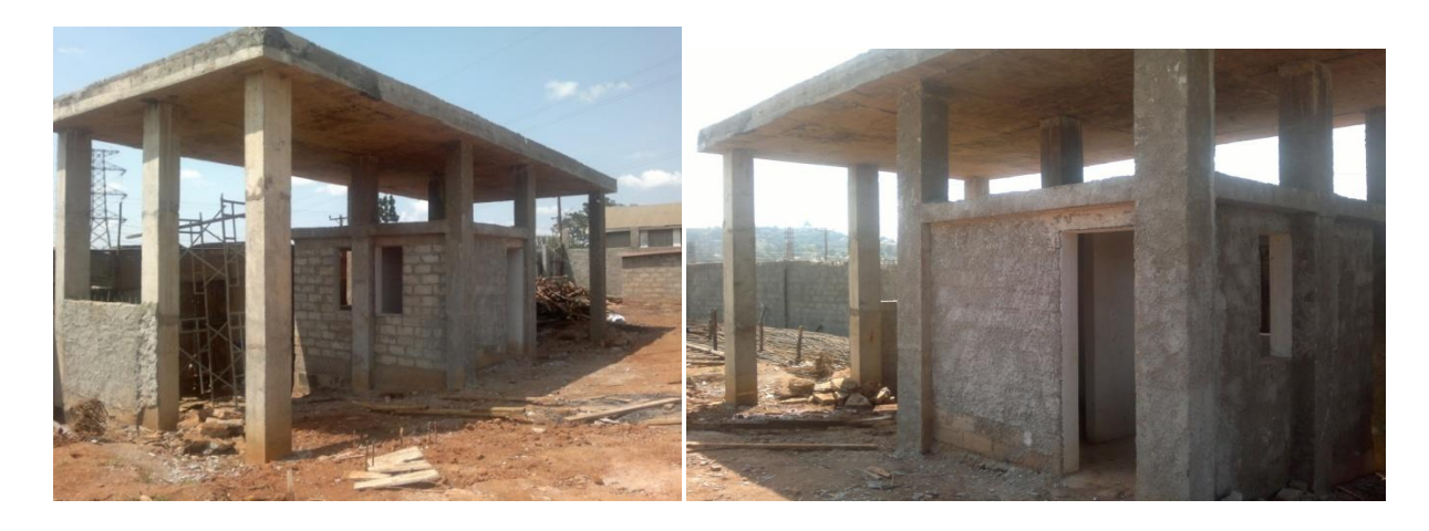
Gate house & Boundary Wall under construction, Bukoto- Meera Investments Ltd