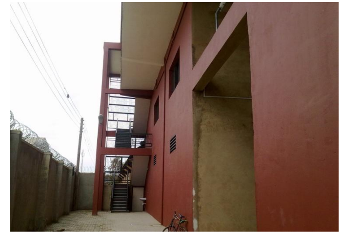
Construction site –sleeping baby factory, industrial Area