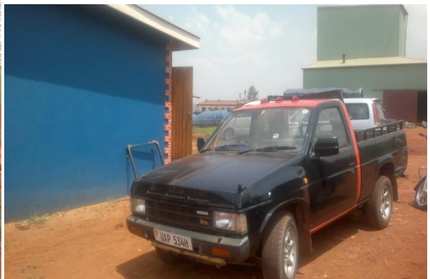
Scafolding and company Pickup truck