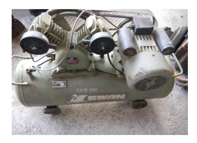
Paint Spray machine