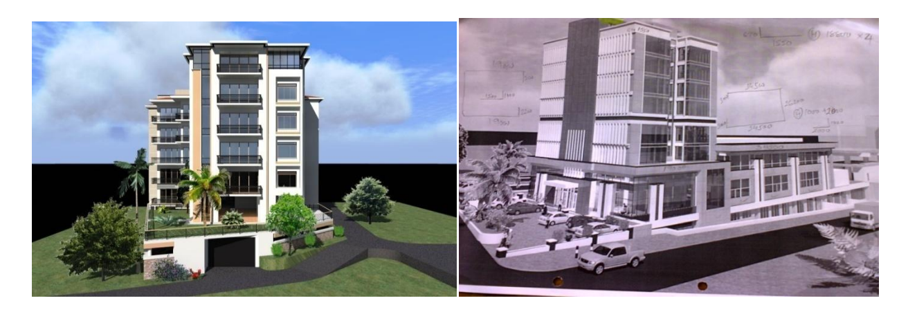
Residential Apartments-Trio Investmt. Offices at Jinja Rd-Meera Investments Td