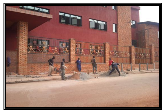
Entrance Gate, Fence and Walk Way- Kampala Parents School