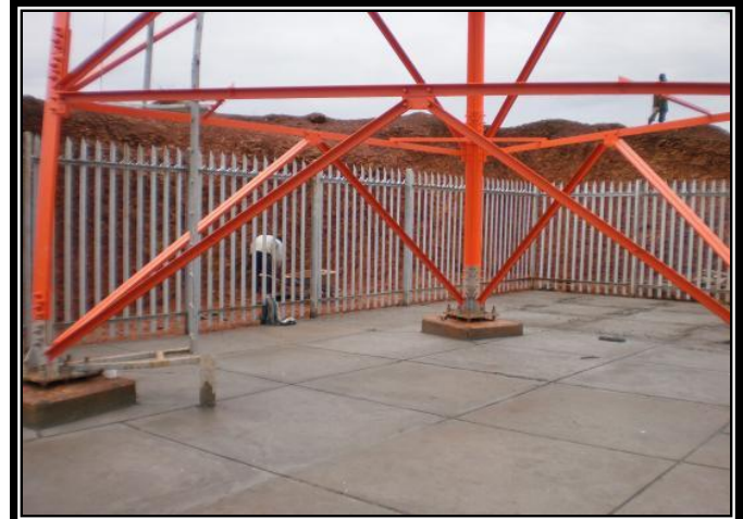
MTN Telecom Tower under Construction