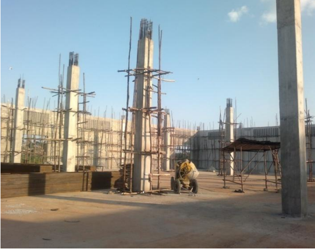
Ware house under construction, Banda site-Meera Investments Ltd