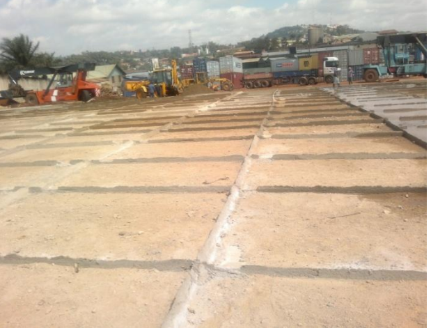
Ware house under construction, Banda site-Meera Investments Ltd & Parking Area under construction, Nakawa Industrial Area-Sunbury Investments Ltd