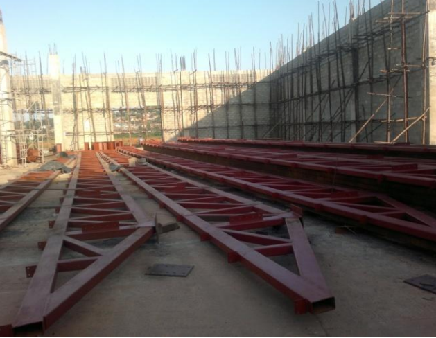
Ware house under construction, Banda site-Meera Investments Ltd