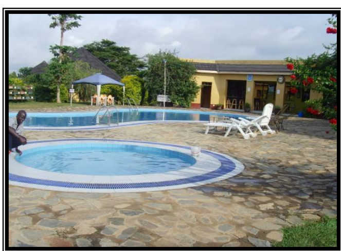
Swimming Pool Tiles and Stone Pitching