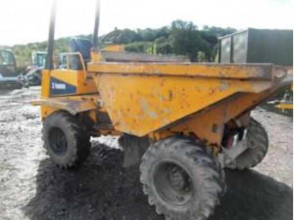
Compressor machine and Dumper