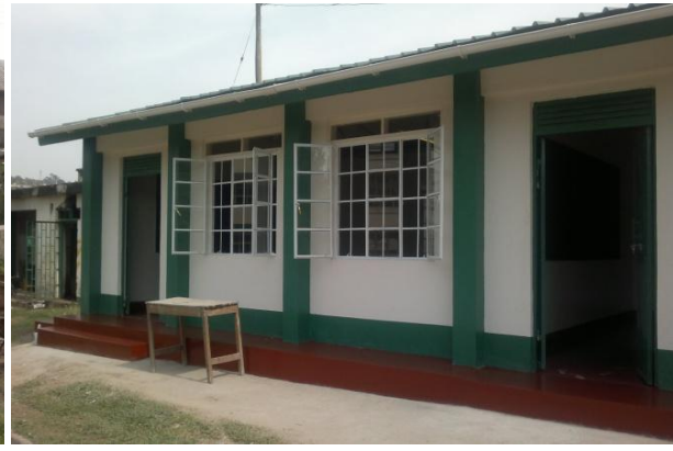
Refurbished Class room Block –Agakhan Education services