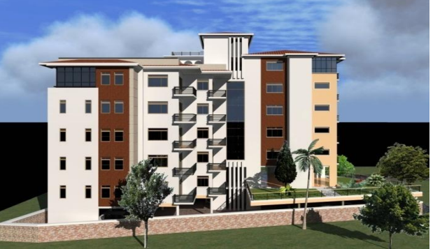
Residential Apartments –Trio Investments Ltd