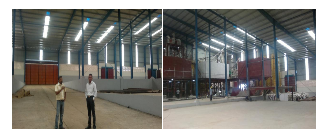
Warehouse constructed-Export Trading Company (U) Ltd