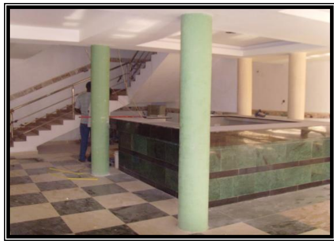
Marble counter Tops, Tiles and Paint work