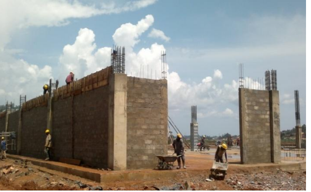
Ware house under construction, Banda site-Meera Investments Ltd