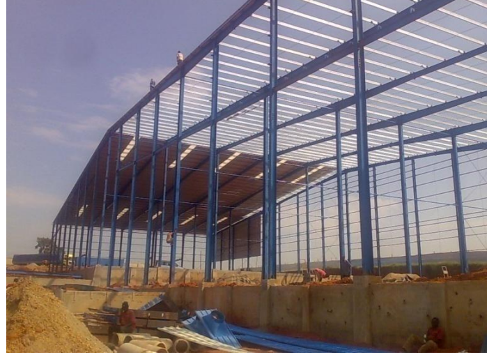
Excavation and Erection of Warehouses