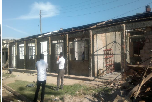
Class Room Block under Refurbishment-Agakhan Education Services