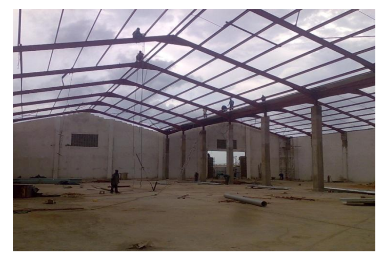
Erection of steel Trusses and roofing-Meera Investments Itd