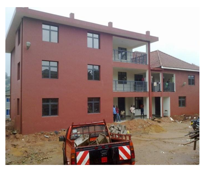
Staff Quarters under construction-Kampala Parents School