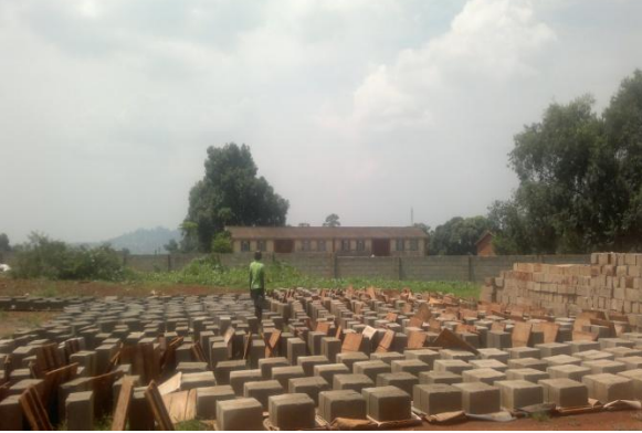
Concrete Block making machine and Blocks produced for the ongoing projects