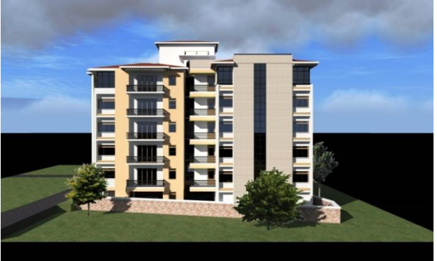
Residential Apartments-Trio Investments Ltd